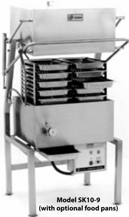
Model SK10-9 (with optional food pans)