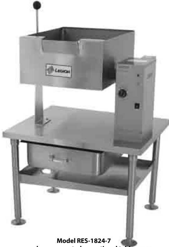
Model RES-1824-7 shown mounted on optional table